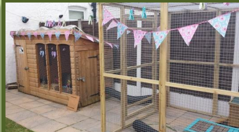
8ftx4ft dog kennel with 6ftx6ft walk in run