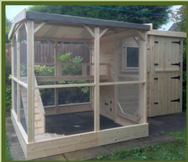
The Freedom Bothy by Manor Pet Housing