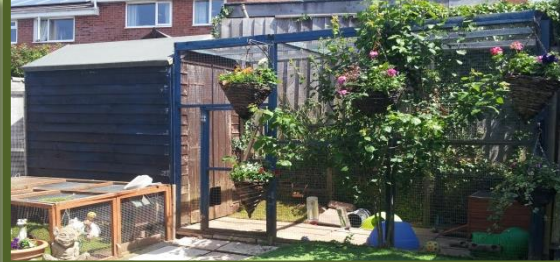
6ftx4ft garden shed with 9ftx4ft walk in run