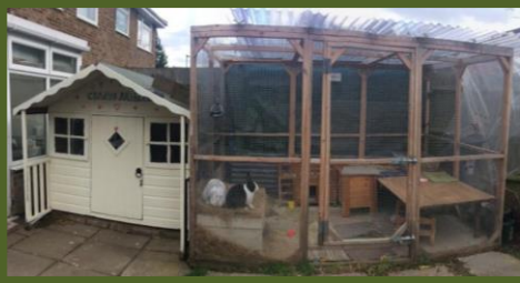
5ftx6ft child's playhouse with 9ftx6ft walk in run