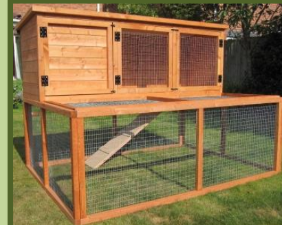
6ftx2ft hutch with 6ftx8ft run under by The Welfare Hutch Company

We follow the guidelines set out by The Rabbit Welfare Association & Fund