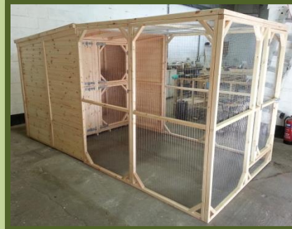
Walk In Double Rabbit Hutch by Boyles Pet Housing